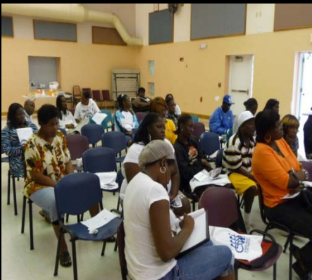
Town Hall Meeting - Liberty City April 21 st , 2010