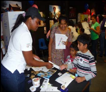
Brain Fair March 20 th , 2010