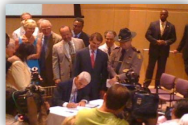
Pictured at left: Red Light Camera Bill Signing Ceremony at the University of Miami

The signing ceremony for the Red Light Camera Bill took place at the Lois Pope LIFE Center, home of The Miami Project to Cure Paralysis, on May 18 th . The ceremony was attended by Florida Governor Charlie Crist, the President of the University of Miami, politicians, and accomplished researchers and clinicians dedicated to discovering a cure for paralysis. The bill, signed by Governor Charlie Crist at the ceremony, authorizes the use of automatic cameras to ticket red light violators and allocates a portion of the funds obtained from tickets to trauma centers and paralysis research.