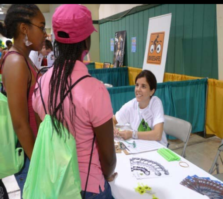
TCT Family Expo May 8 th , 2010