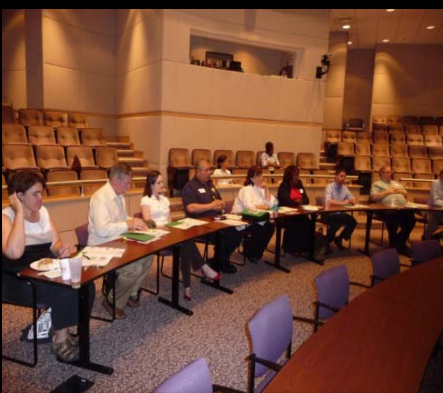
WalkSafe™ Task Force Meeting May 17 th , 2010