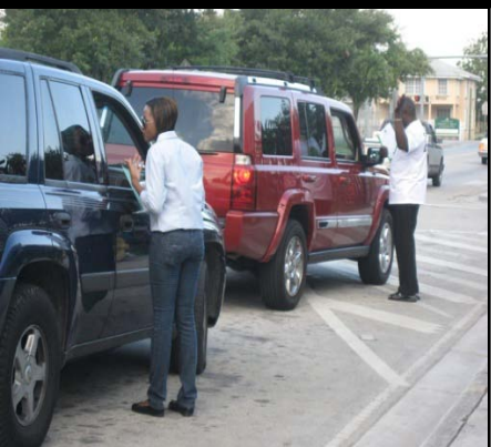
NPW in Homestead May 13 th , 2010